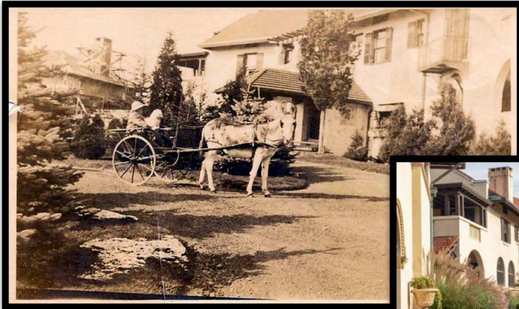
The ballroom of Carmore is still under construction in the image above from C. 1910-1915. The photograph to the right depicts how the Rushmore Estate appears today.